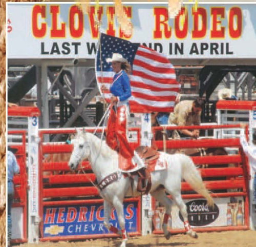
A COMMUNITY TRADITION