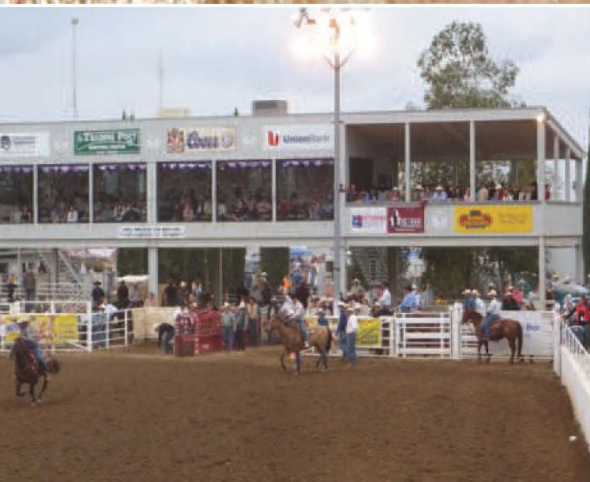
TOM STEARNS VIP PAVILION